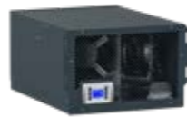
MRAC MINI RACK COOLER FOR HIGH DENSITY SYSTEM