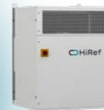
FCB DIRECT FREE-COOLING UNIT FOR SHELTERS DESIGNED FOR TECHNOLOGICAL EQUIPMENT