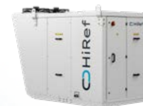
HTR/NTR ROOFTOP AIR CONDITIONING UNIT WITH ON/OFF OR MODULATING COMPRESSORS FOR CONTAINERS