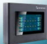
HINODE ADVANCED TECHNOLOGY AND FLEXIBILITY TO MANAGE AIR CONDITIONING AND PROCESS COOLING