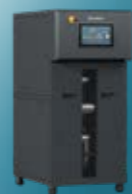
CDU COOLANT DISTRIBUTION UNITS FOR HIGH DENSITY HYPERSCALE DATA CENTERS