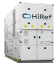
DataBatic AIR-TO-AIR SYSTEM FOR DATA CENTERS WITH ADIABATIC SYSTEM