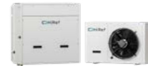
HTS/NTS SPLIT UNITS WITH ON/OFF OR MODULATING COMPRESSORS FOR SHELTERS DESIGNED FOR IT EQUIPMENT