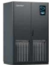
NRG AIR CONDENSED PERIMETER MOUNTED UNITS FOR DATA CENTRES WITH MODULATING COMPRESSORS