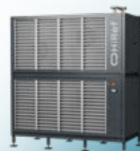
FanWall CHILLED WATER OR DIRECT EXPANSION FANWALL AIR CONDITIONERS FOR HIGH DENSITY HYPERSCALE DATA CENTERS