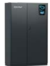
JREF CHILLED WATER PERIMETER-MOUNTED UNITS FOR DATA CENTERS