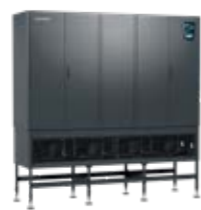
TRF DIRECT EXPANSION OR CHILLED WATER PERIMETER-MOUNTED UNITS FOR DATA CENTERS