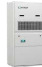
HTD/U/X NTD/U/X INDOOR MODULATING ON/OFF OR MONOBLOC UNITS FOR SHELTERS DESIGNED FOR IT EQUIPMENT