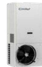
HTW/HTWD NTW/NTWD OUTDOOR MONOBLOC UNIT WITH ON/OFF OR MODULATING COMPRESSORS FOR SHELTERS DESIGNED FOR IT EQUIPMENT