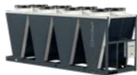
HDC MODULAR DRY COOLER FOR HIGH DENSITY HYPERSCALE DATA CENTER